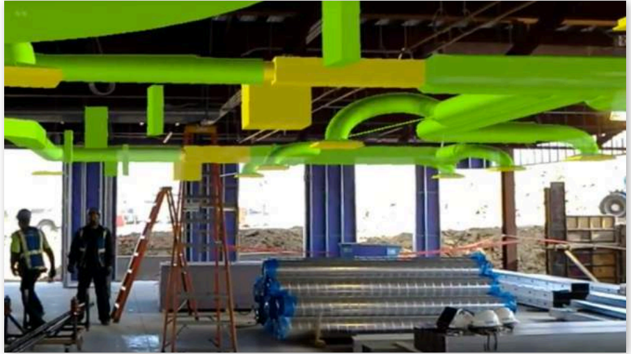
Screenshot from Trimble Connect for HoloLens

Built on the cloud-hosted Trimble Connect collaboration platform, Trimble Connect for HoloLens supports a new way of working with AECO models throughout the building lifecycle, providing every stakeholder with the most up-to-date data on their site, literally.